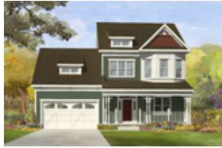
Optional Elevation 1