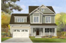
Optional Elevation 2