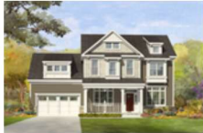
Optional Elevation 1