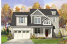
Optional Elevation 2