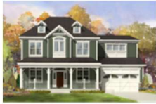
Optional Elevation 1