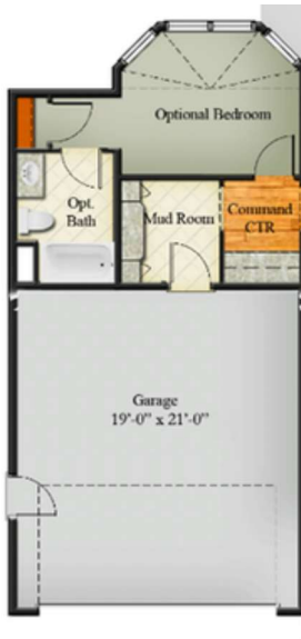
Optional 1 st Floor BR & Bath