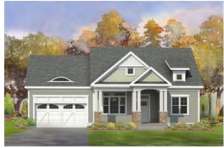
Optional Elevation 1