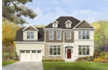
Optional Elevation 2