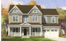
Optional Elevation 2