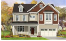
Optional Elevation 2