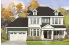
Optional Elevation 2