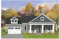
Optional Elevation 1