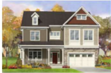
Optional Elevation 1