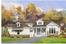
Optional Elevation 1