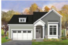
Optional Elevation 1