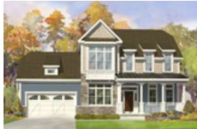
Optional Elevation 1