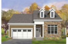
Optional Elevation 2